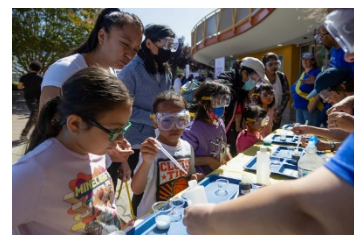
ACS Kids Zone (EPNAC.com)