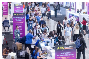
ACS fall 2023, San Francisco, CA