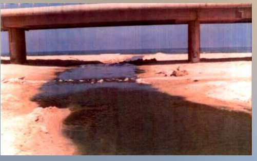
Pollution by leaching waste water (Gaza Valley).