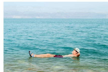
Man Floating in Dead Sea

This person is floating in the Dead Sea, which is a very salty lake in the Middle East. The Dead Sea is more than eight times as salty as the ocean, so the water is very dense and things float in it easily.