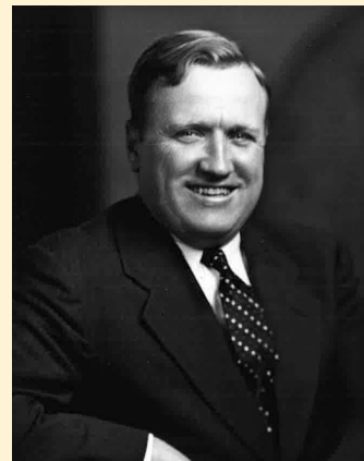
Spedding, circa 1944

At first glance, it is puzzling that Frank Spedding, a young Iowa State professor who had never been involved in uranium research, would be asked to direct some of the nation's best-known atomic chemists for the Manhattan Project. But he was uniquely qualified, thanks to his varied training and his expertise in the chemistry of rare earth metals, which are chemically similar to the actinide series of elements that include uranium.