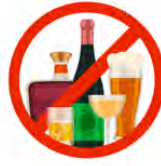
Eliminate alcohol 4 hours before bed