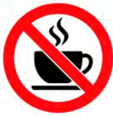
Eliminate caffeine 8 hours before bed