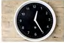
Develop a sleep schedule and routine