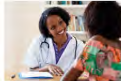
Seek medical help/therapy if you do not see a consistent improvement after 2 weeks.

Circle two things you can try to help improve your sleep, and pick a date to try them. Write down more ideas below!