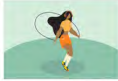
Increase workout intensity