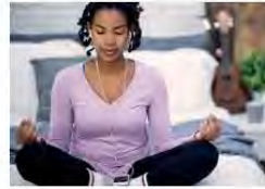
Meditate to fall asleep