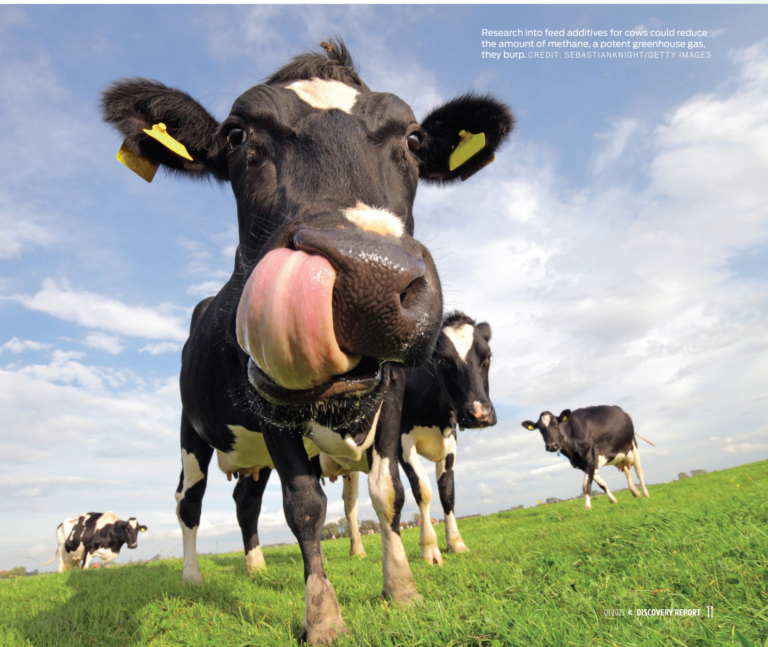
Research into feed additives for cows could reduce the amount of methane, a potent greenhouse gas, they burp.

Sources: Intergovernmental Panel on Climate Change, ACS Zero Hunger Summit, World Resources Institute