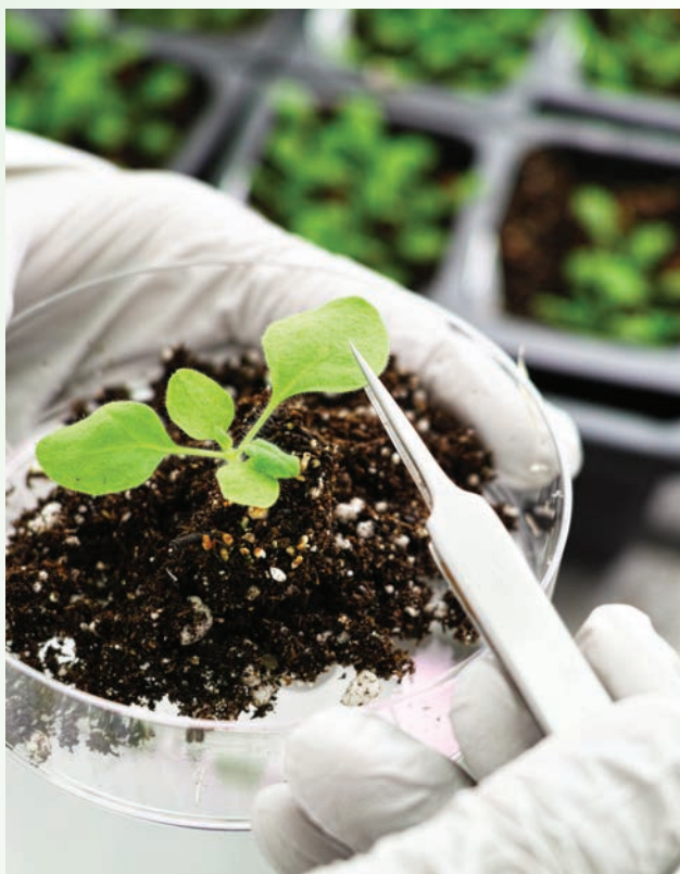
In recent field studies, plants genetically engineered for efficient photosynthesis grew faster than non-engineered plants.

protecting against yield losses experienced at elevated temperatures ( Science 2019, DOI: 10.1126/science.aat9077; Plant Biotechnol. J. 2021, DOI: 10.1111/pbi.13750).