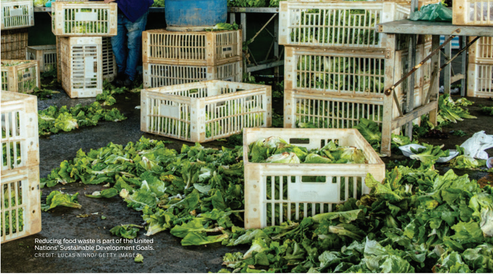
Reducing food waste is part of the United Nations' Sustainable Development Goals.