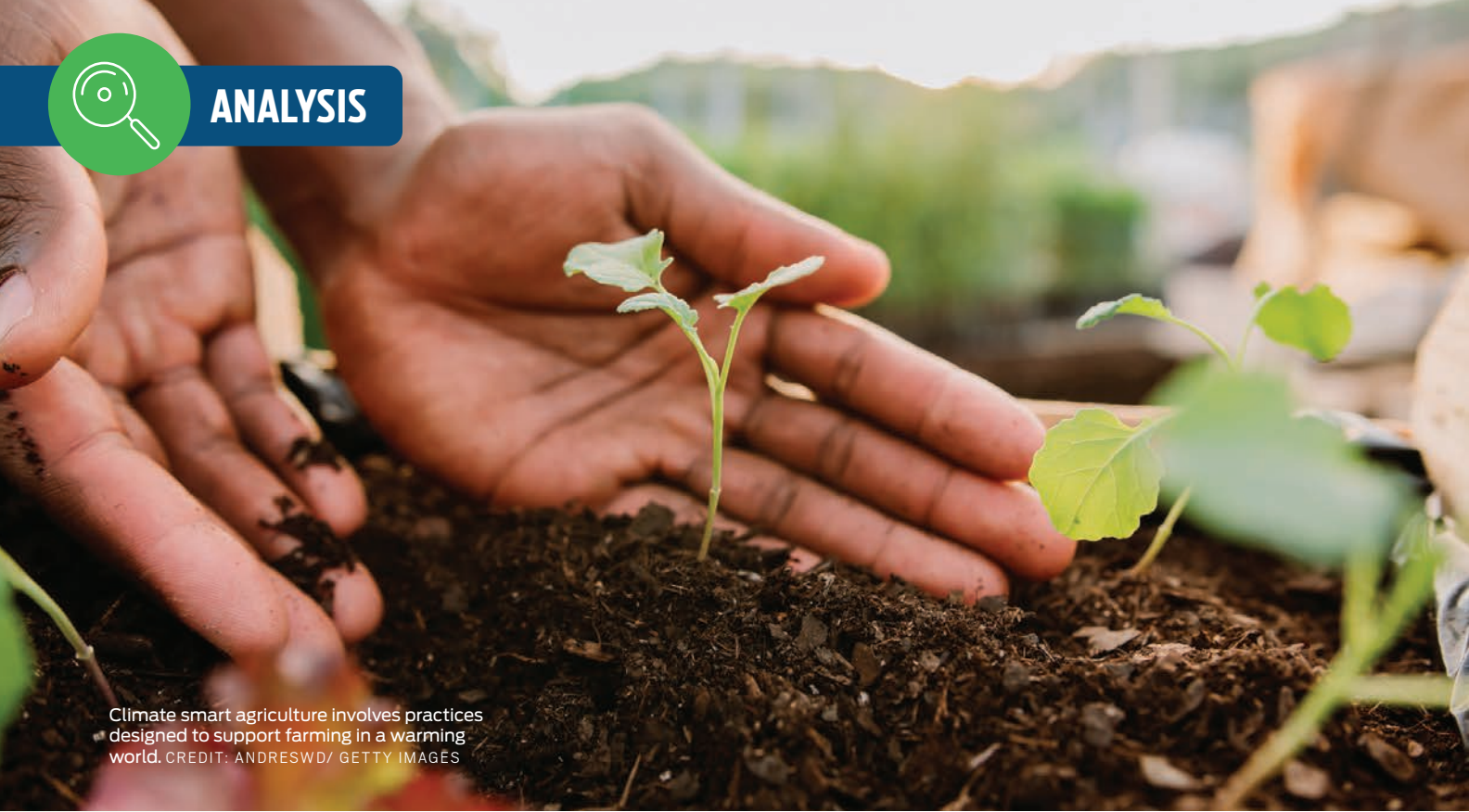
Climate smart agriculture involves practices designed to support farming in a warming world.