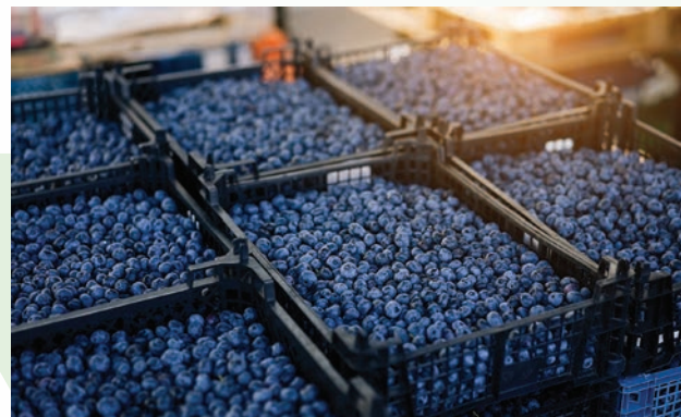
Blueberries bruised during transport have a shortened shelf life.

Optical sensors are better suited for real-time testing. "Optical methods are a promising approach for rapid detection," Park says. "Hyperspectral microscope imaging technology can detect foodborne bacteria at the single-cell level using spectra, morphology, and scattering intensity information."