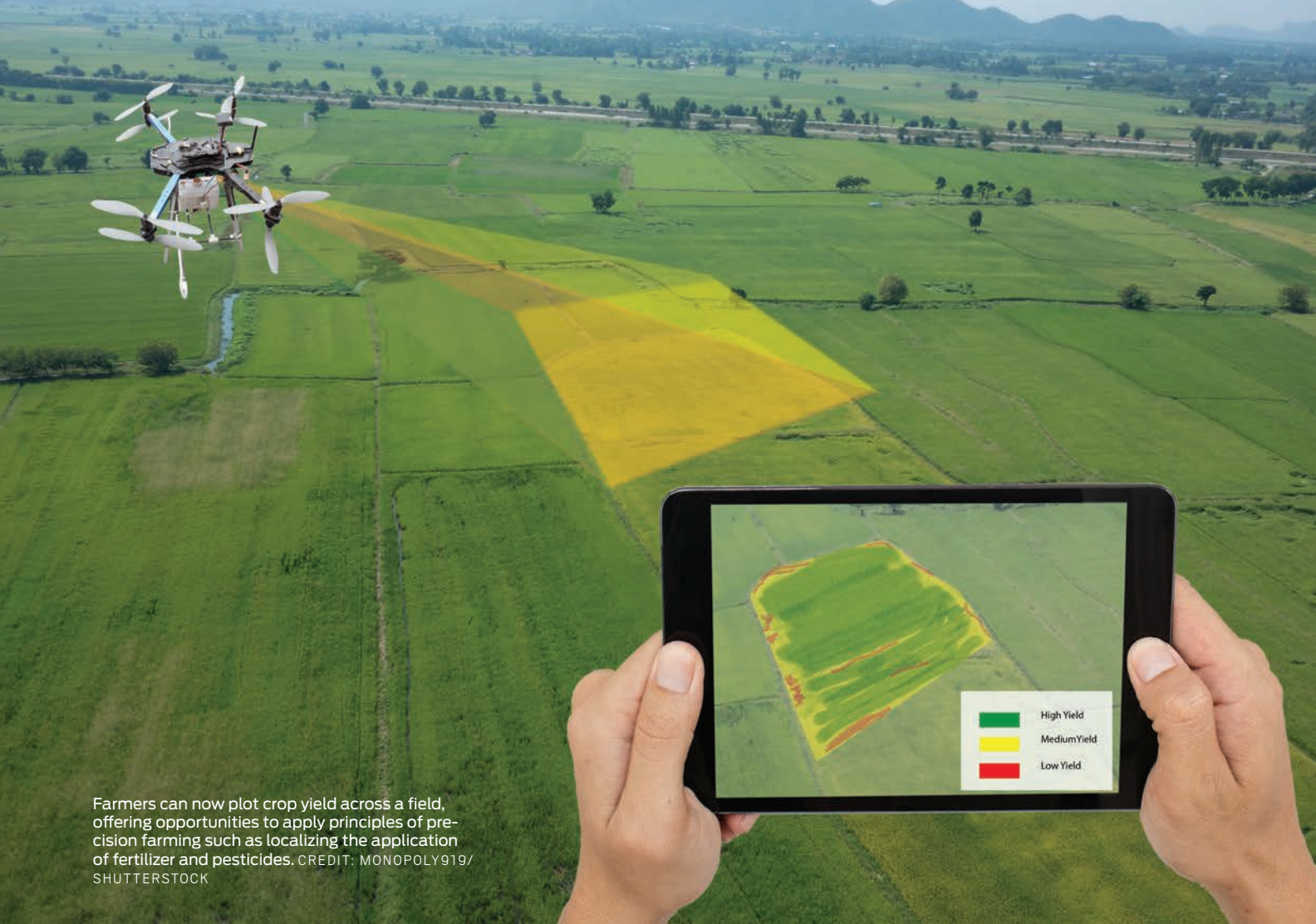
Farmers can now plot crop yield across a field, offering opportunities to apply principles of precision farming such as localizing the application of fertilizer and pesticides.

growers must select what is best for their situation. “Agriculture is a very local practice,” Shelton says. “It adapts to and addresses crops that are being grown in local environments, with local practices, with local conditions and local pests.”