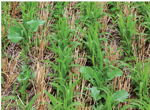
A cover crop grows between rows of harvested stalks.

One of the things that will help propel precision agriculture forward is better chemical data. “We need accurate cloud-based, connected sensors for soil,” Elrick says. “These advancements would be key in establishing the ground truth that data scientists need to build machine learning predictive models.”