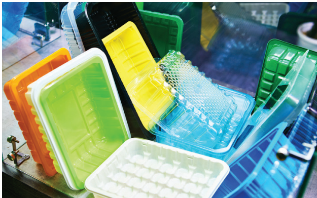
Plastic food packaging can be made with multiple layers of plastic that are hard to separate during recycling.

Though each layer may be recyclable individually, it's often not practical to separate them. In addition, food packaging plastic is often mixed in with food waste, which interferes with recycling.