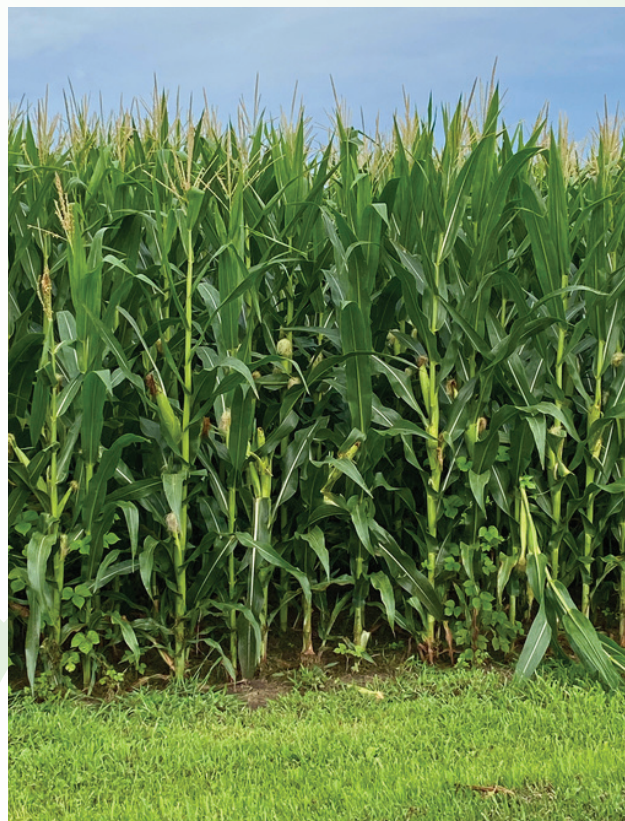
The tall stalk of fast-growing corn makes the plant vulnerable to breaking during storms.

By targeting a hormonal pathway responsible for stalk elongation, Bayer Crop Science produced a variety of corn that reaches a maximum of approximately 2 meters (7 feet). This lower height reduces the strain on the stalks during turbulent weather. “We have been able to create a shorter-stature plant that still looks and acts like corn,” Bouvrette-McKinney says. “We see an inherent improvement in standability of these plants.” Increased resilience has been achieved while preserving typical corn characteristics, such as growing time or the average number of cobs per stalk.