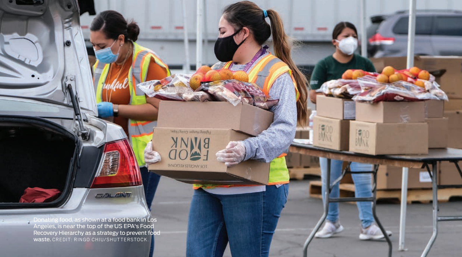
Donating food, as shown at a food bank in Los Angeles, is near the top of the US EPA's Food Recovery Hierarchy as a strategy to prevent food waste.