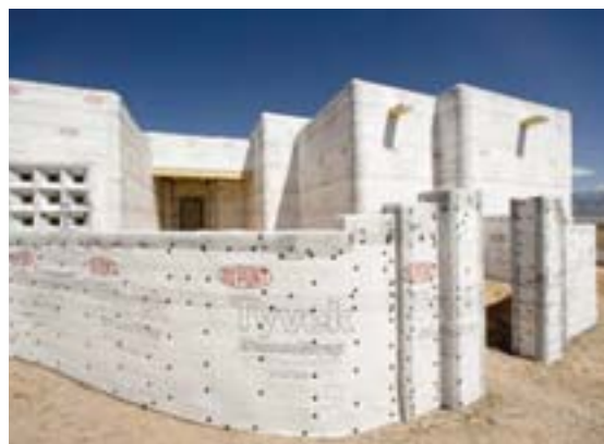
Vision House 2006 in Albuquerque, New Mexico.

An unusual application is kitchen and bath cabinets made from wheat straw. The straw is a waste product from agriculture. Wheat heads are cut off the plant, leaving the stems behind. The chopped straw is glued together with nonformaldehyde containing adhesives and pressed into shape. The cabinets look and feel just like wood, and they are produced from 85% renewable materials.