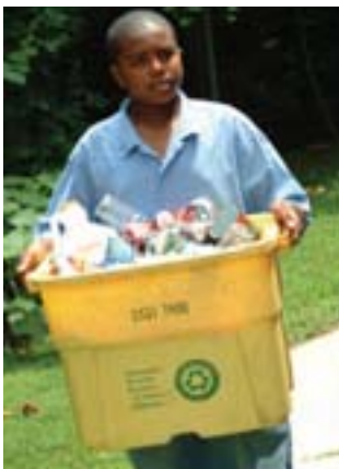
Recycling: part of Green Living includes sustainability, taking responsibility for the protection of our natural resources.