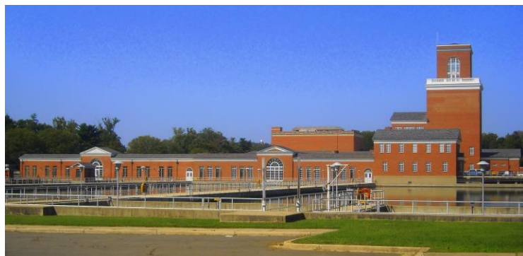
Dalecarlia Water Treatment Plant

The delegation spent the morning on a guided tour of the Dalecarlia Water Treatment Plant. Dalecarlia is one of two water treatment plants that provide drinking water to roughly 1 million people in Washington and Arlington, Virginia, who get their water from the Washington Aqueduct 36 . While on the tour, the delegation learned about the processes by which the water that enters the plant gets treated — from the sedimentation and filtration of solids and particles to disinfection with chlorine and ammonia 37 .