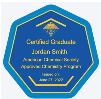
Figure 2: Sample electronic credential earned by students completing the ACS Approved curriculum.

Electronic Badging: Students that complete the curriculum that has been approved by ACS are eligible for certified degrees. Students that earn these degrees receive a certificate of achievement from the ACS celebrating their success. For the 2022 spring commencements, we've begun a pilot program to offer these students an electronic badge that celebrates their accomplishment. This digital credential can be displayed, accessed, and verified online. Currently, we have issued almost 1000 badges, with over half of them being viewed and shared. Figure 2 illustrates an example of the badge (note that this is not an "active" badge).