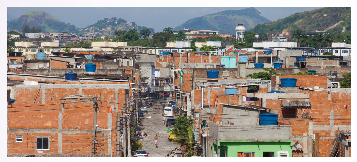
A global workforce has the capacity to craft innovative solutions with a broad impact while remaining rooted in local contexts.

countries to participate on the world stage. He believes it is unfair to ask researchers in such countries to compete with fewer resources. "I'm really concerned that science can be a divider," he says.