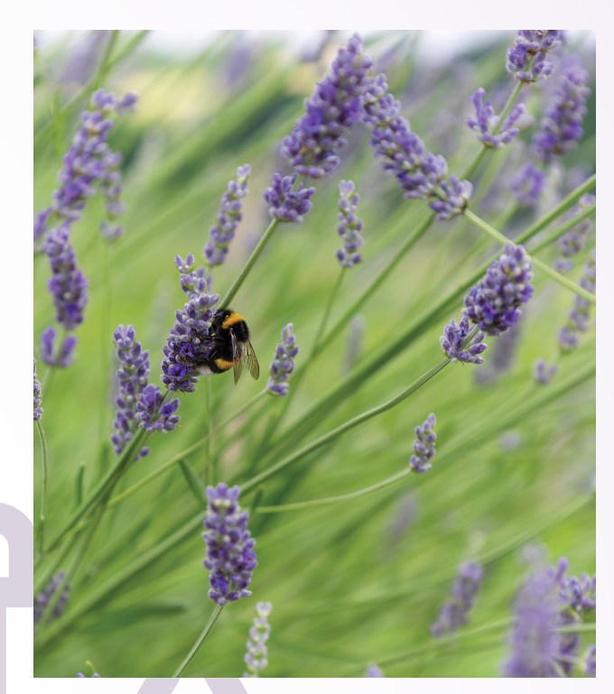
From pollinators to people, environtmental pollution is a pervasive threat.

"Collectively, we need to decide whether saving people is our 'why,' and if it is, we need to embed that in our day-