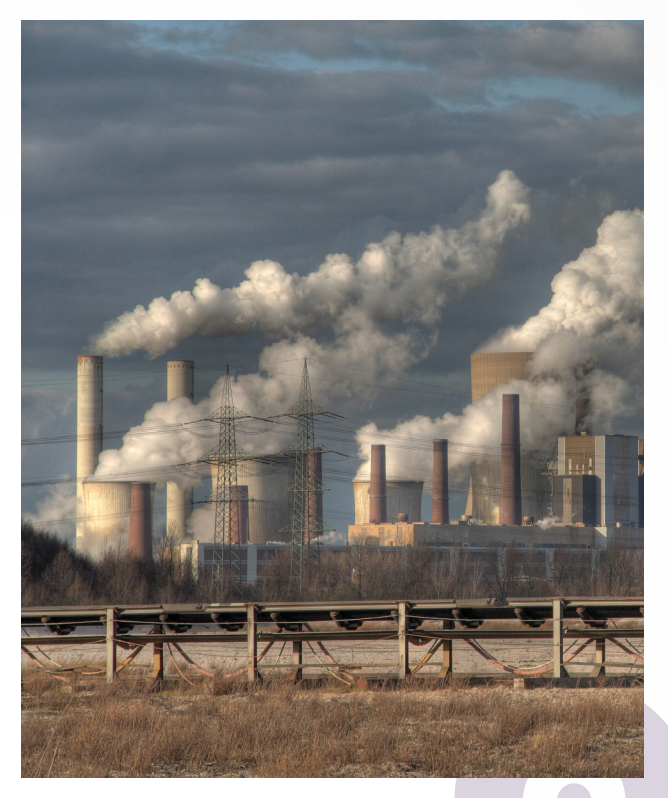
Communities neighboring pollution sources are often constrained in their pursuit of a healthy lifestyle.