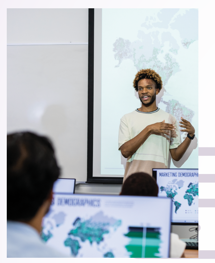
Industry has increasingly recognized the need to start early with workforce training.

acting reactively or getting paranoid, but the reality is, it's the right thing to do."